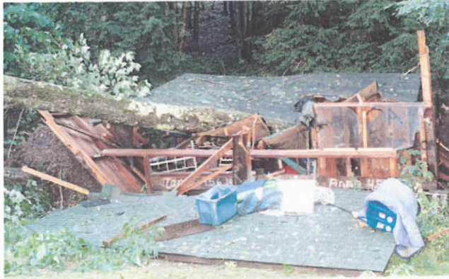
Cabin 12 was also destroyed when this tree toppled down.