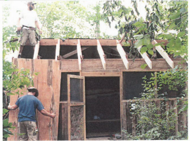
Cabin 7 gets a new roof thanks to the volunteers.