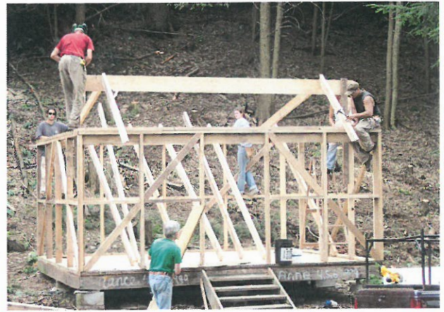
Floyd Vogt & friends start rebuilding Cabin 12.