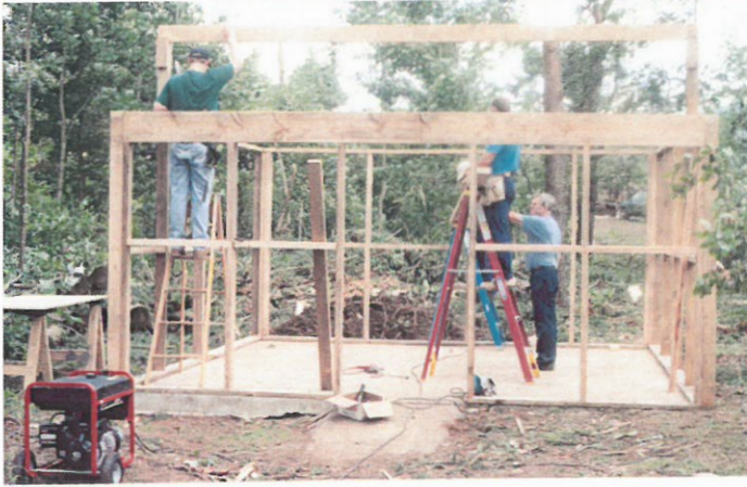
Volunteers from Medical Coaches start rebuilding Cabin 8.