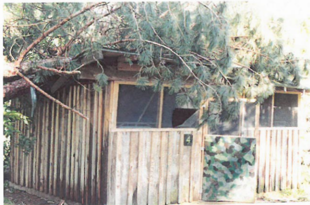
Cabin 4 lost the roof and one wall.

Below was the home of the Ropes Course. The Stop Sign did not deter the storm.