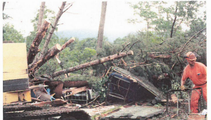
Cabin 14 finally getting the debris removed. Below, the 2 beautiful trees in front of Rice Hall are now gone.