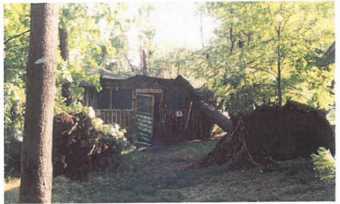
Cabin 8 was in the wrong place when this huge tree blew over.

Even though there are many changes, the spirit of Shankitunk will remain!!