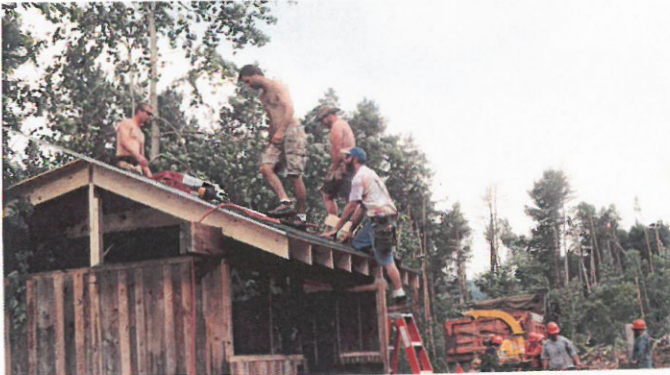
Cabin 3 quickly on the mend thanks to Tamarack Construction. Below, a view of the destruction from Arbor Hill.